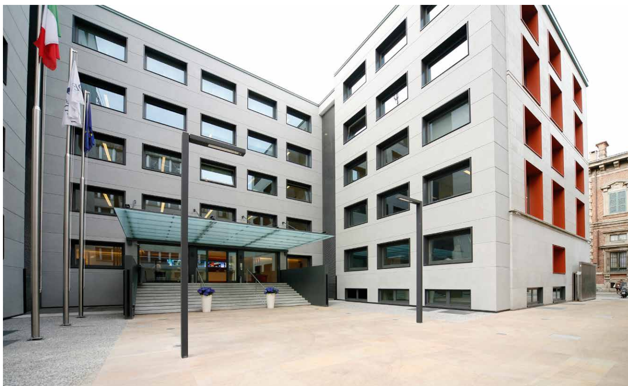
DeA Capital Group's Headquarters.